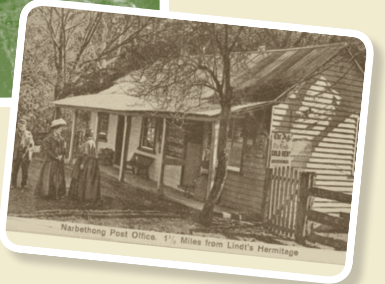
Narbethong Post Office, 1901

NARBETHONG'S POST OFFICE OPENED ON 16 OCTOBER 1883 AND CLOSED NEARLY 100 YEARS LATER IN MAY 1993.