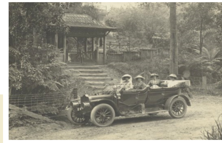
Four women in a car at the Hermitage, May 1913

THE BLACK SPUR INN AND NARBETHONG HOUSE WERE POPULAR GUESTHOUSES IN NARBETHONG.