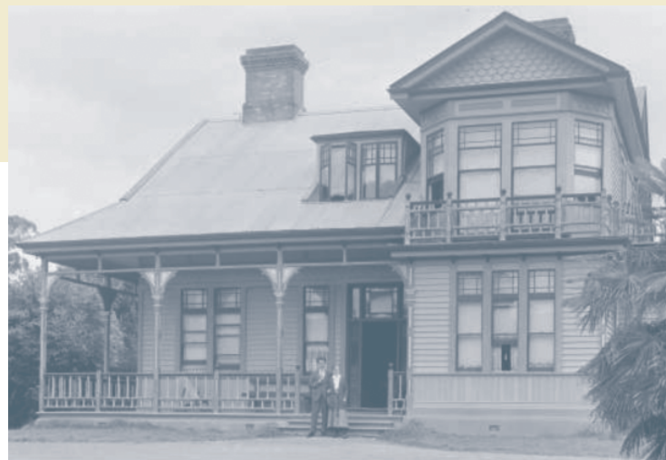
St Fillan's guesthouse, c. 1940-60

The town was surveyed in 1865 and the awe-inspiring forests surrounding it soon attracted both timber millers and tourists from Melbourne and surrounds. Guesthouses quickly popped up in the late 19th century. The most famous of these was the Hermitage.