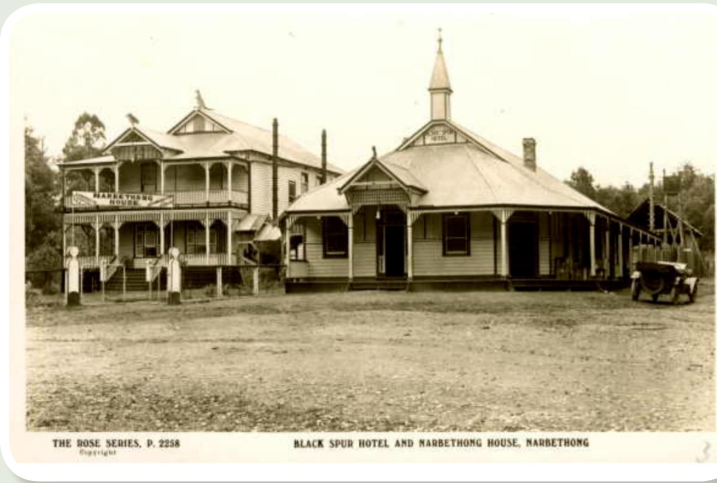
Black Spur Inn and Narbethong House, c. 1918